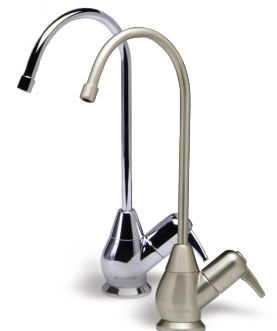
OPTIONAL Chrome and Brushed Nickel Faucet Finishes